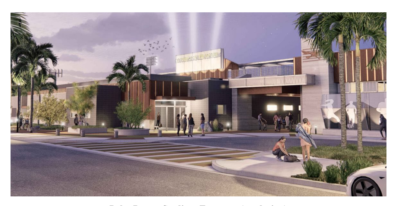
Palm Desert Stadium Entrance (rendering)

The following tables reflect financial reports and information presented to the Citizens' Bond Oversight Committee by District staff. Administrative and bond issuance costs are excluded.