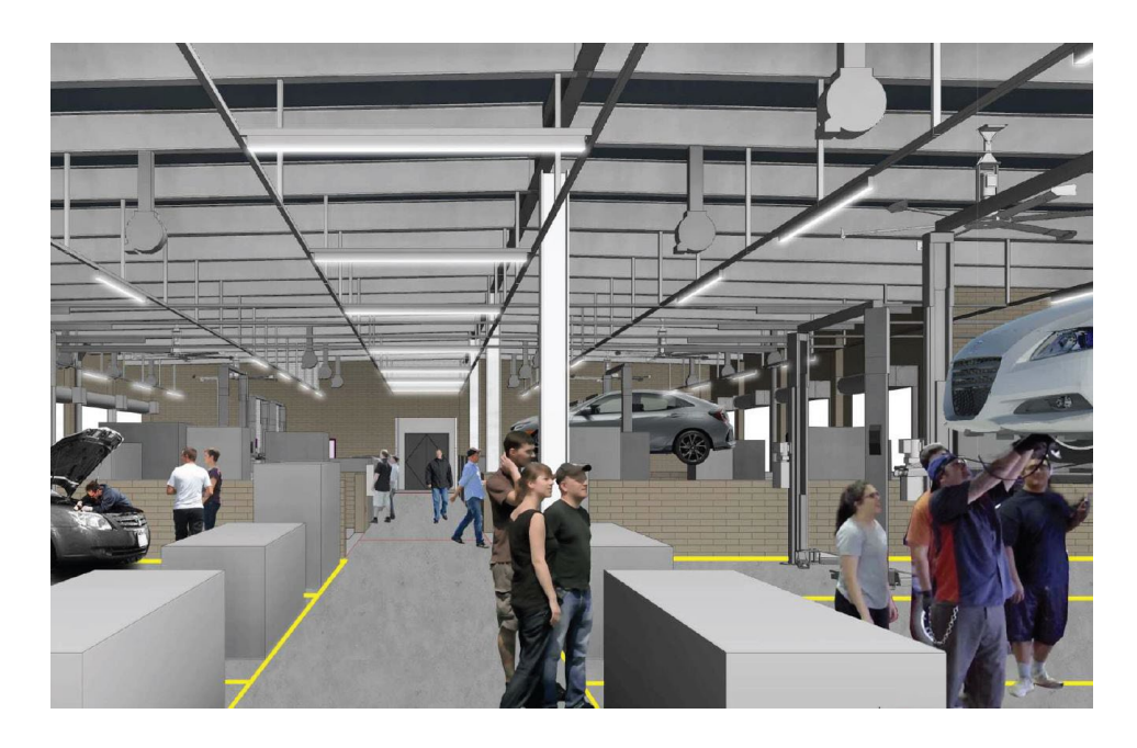
Cathedral City Roadrunner Motors - Lift Gallery (Rendering)