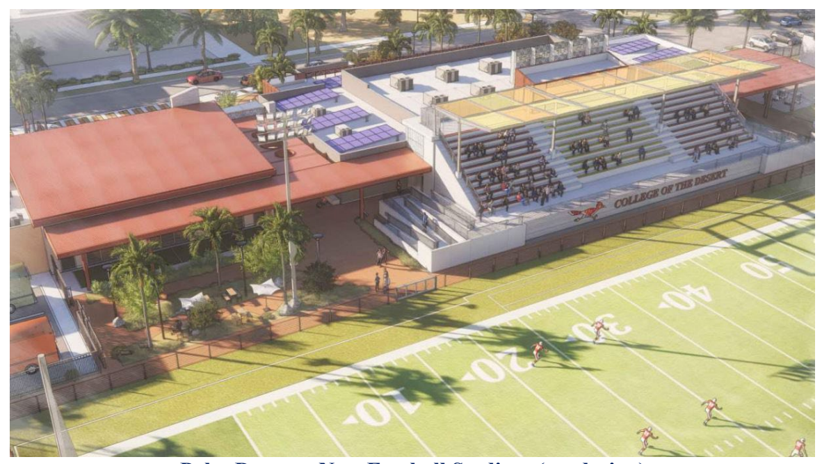
Palm Desert - New Football Stadium (rendering)

An Athletics Stadium and Fields Project (ASFP) is funded using Measure CC Bond Funds. The project will demolish the existing football stadium on the Palm Desert Stadium and construct a 20,000 square foot stadium that can seat approximately 500 people and will also provide space for team locker rooms and associated support spaces. In addition, the project will install new sports lighting at both the football and soccer fields and install new landscaping and an improved surface parking lot.