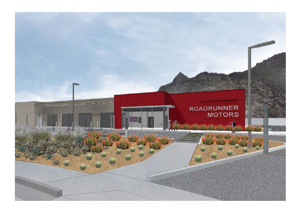
Roadrunner Motors Main Entrance (rendering)

The popular automotive technology programs will relocate from the Palm Desert Campus to a new location in Cathedral City to provide modernized training facilities for this rapidly changing industry (about 26,000 square feet). Specialized equipment and a small fleet of vehicles will be used for direct student instruction. Proximity to auto dealerships will provide students with real-world experience and strengthen workforce ties to local automobile businesses. The new facility will include specialized and generalized classrooms, teaching laboratories, service vehicle bays/lifts, offices, conference/briefing rooms, support space, and surface parking. The project is funded using Measure CC Bond Funds and is scheduled for a Spring 2026 building opening.