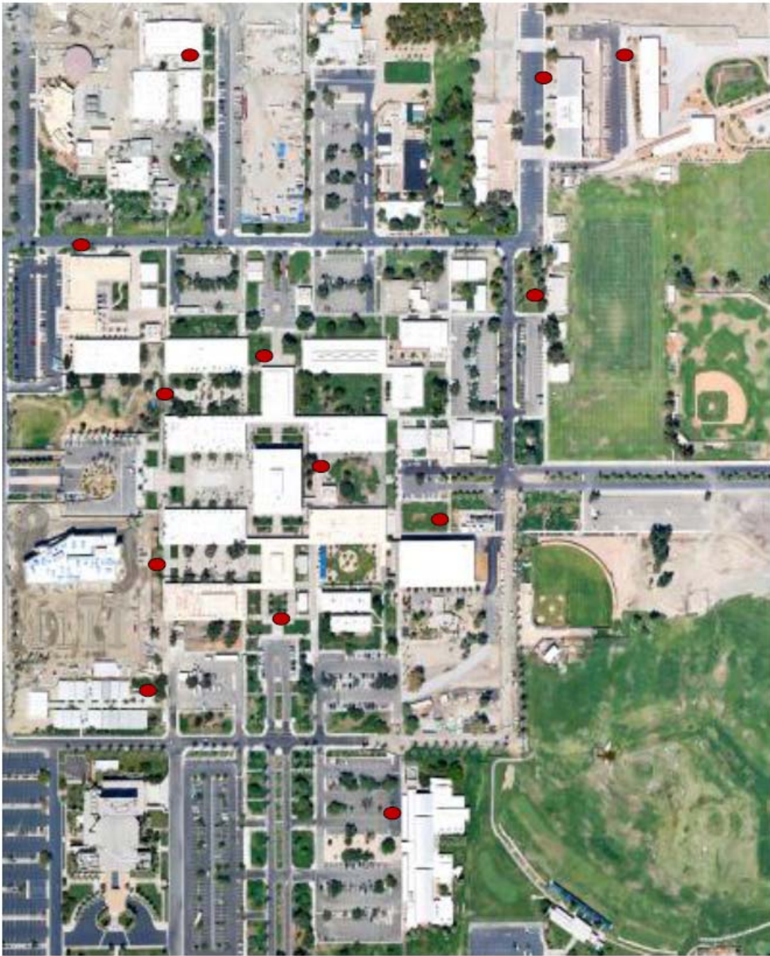
Bicycle and Skateboard Rack Locations